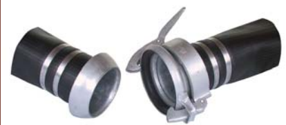
Coupling System Perrot

certified according to DIN EN ISO 9001 : 2008 Quality Management System