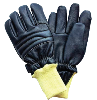
>> Model: FLASH short - with heat resistant knit cuff

The fire brigade protection glove FLASH is provided with a fireproof, black cow grain leather which gives a secure and pleasant level of wearing comfort. An additional Needlona® heat resistant felt as a heat insulation is protecting due to thermal load.