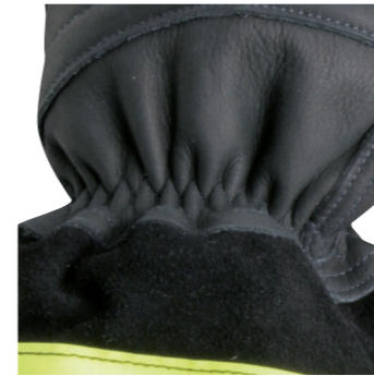
>> elastic knitted wrist