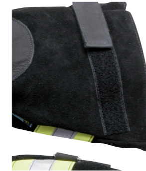
>> deflectable velcro and carabiner hook and eyelet (Model: FLASH long)