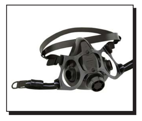
North 7700 Series Half Mask "The industry standard"