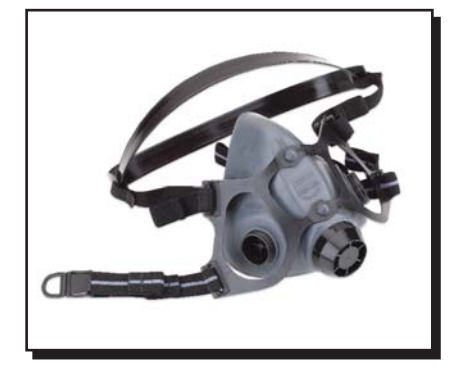
North 5500 Series Half Mask "The economical alternative"